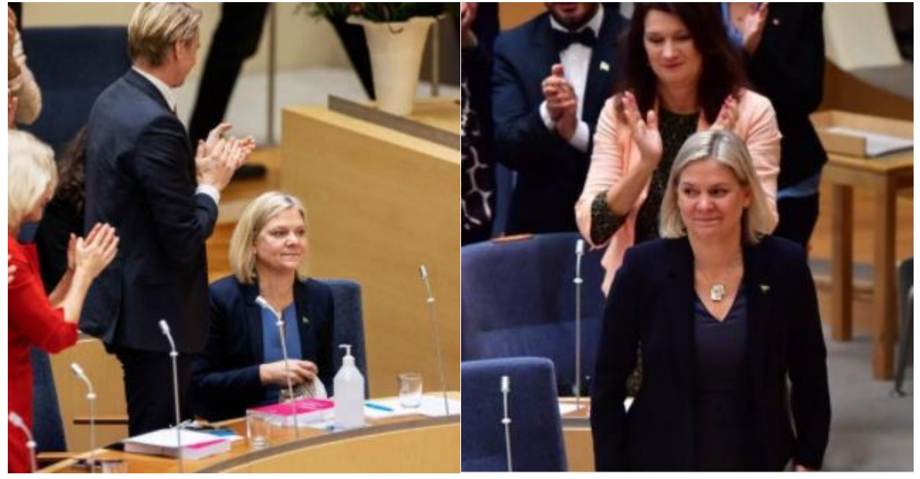
Confidence boost: from left, Andersson as the first female Prime Minister of socially progressive Sweden, seven hours before resigning, then again the following week after being voted back as Prime Minister.